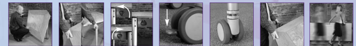
Kite® Table User Guide

'The world's leading flexible folding table system'